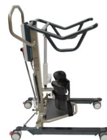
Stand up lift RAISA E / Standard