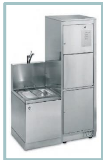
Also available in version with spout left or right BP 100 HSE-AG