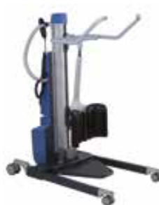
Stand up lift RAISA PRO