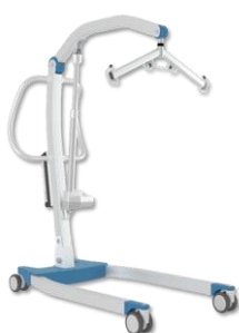
Patient lifter myDIANA