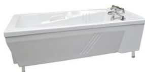
Stand bathtub LENA