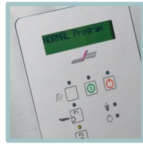
LCD control panel