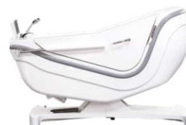
tilting bathtub iTub SWING