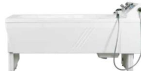
hi-lo bathtub iTub LENA