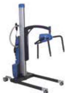
Patient lifter LEXA PRO