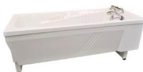
hi-lo bathtub LENA100